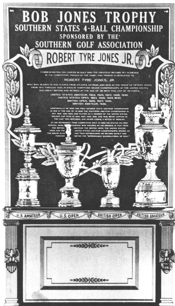
Bob Jones Trophy awarded annually for permanent possession to each four players from the same state with the lowest total qualifying score.