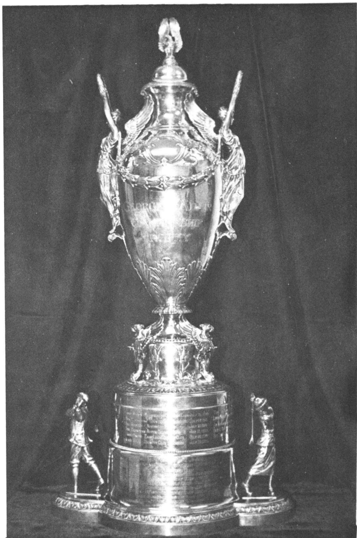
The George W. Adair Memorial Trophy, which was awarded each year to the winner of the Southern Golf Association Championship, is now enshrined in the Bob Jones Trophy Room, Atlanta Athletic Club, Atlanta, Georgia. However, each year the name of the New Champion is engraved on the trophy.