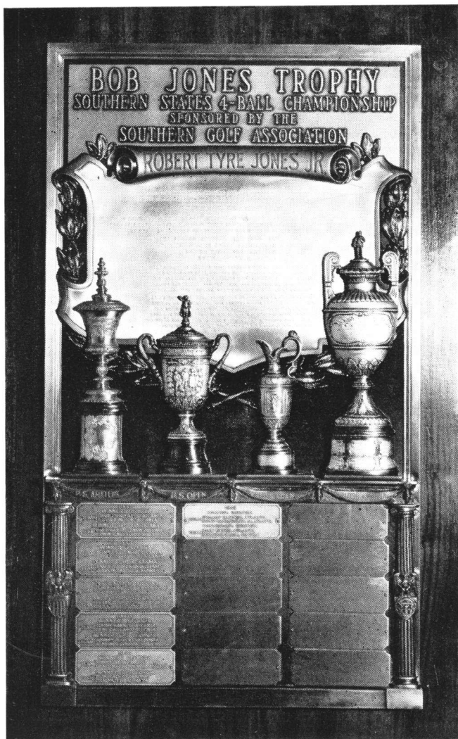
Played for each year by teams from the fourteen States in the Southern Territory