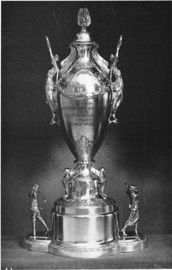
The Geo. W. Adair Memorial Trophy, going each year to the winner of the Southern Championship for that year